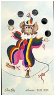
Bean Bag Toss

Who: Beavers & Cubs & their families (Brown tails must be accompanied by their Parents)